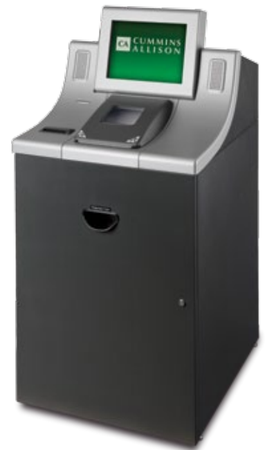
The self-service Money Machine provides fast, reliable coin-counting capabilities for People’s Choice Credit Union members.